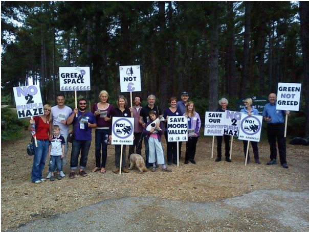
Supporters at Ellingham Show 2011

In response to Dorset County Council's (DCC's) Mineral Site Plan consultation, everything possible is being done to get Purple Haze South screened out early on. Please see what we intend to say to DCC in the campaign's DRAFT comments now online at http://www.no2purplehaze.co.uk/news.htm .